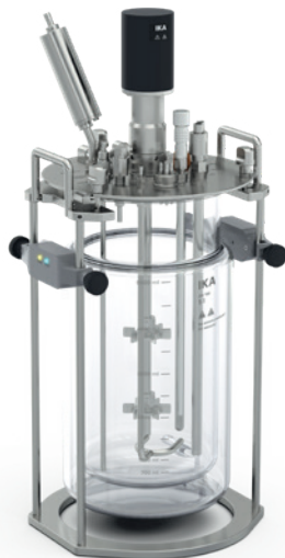
For example HABITAT ferment dw 5 for 5 liters

Now you can complete your control unit package with the matching vessels: In addition to the control unit package, you order the matching vessel package according to your application and your working volume. And you're ready to go.