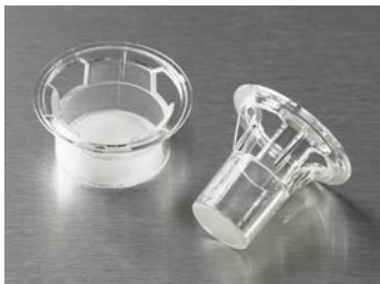
24 and 6.5 mm Transwell inserts

Corning offers four types of individual inserts: