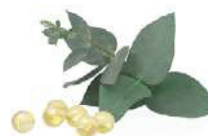
Classic Code: 320100 Fragrance Eucalyptus