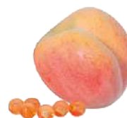
Peach Code: 320500 Fragrance Peach