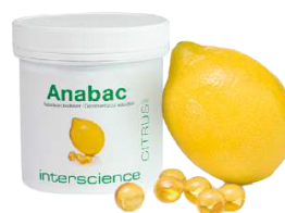
Citrus Code: 320300 Fragrance Lemon