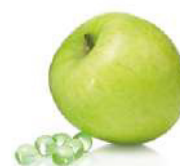
Poma Code: 320200 Fragrance Apple