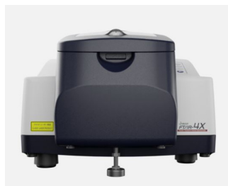
Large Sample Compartment

Accessories: available at additional cost