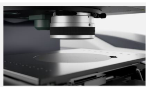
Options for FTIR Microscope and IR Imaging