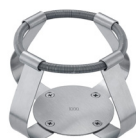
Flask fixing clips