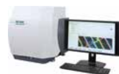
Confocal Raman Microscope