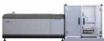
Automated High-Throughput CD (HTCD)